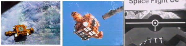
Figure 1: Images observed during satellite capture. The left and center images were captured using the shuttle bay cameras. The right image was captured by the end-effector camera. The center image shows the arm in hovering position prior to the final capture phase. The shuttle crew use these images during satellite rendezvous and capture to locate the satellite at a distance of approximately 100m, to approach it, and to capture it with the Canadarm—the shuttle manipulator.

the vision system. The ability to plan allows the system to handle unforeseen situations.