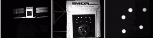
Figure 2: Images from a sequence recorded during an experiment (left image at 5m; right at 0.2m)

step solves the four unresolved DOFs—the rotation around the major axis and the three translations—by an exhaustive 3D template matching over the remaining four DOFs.